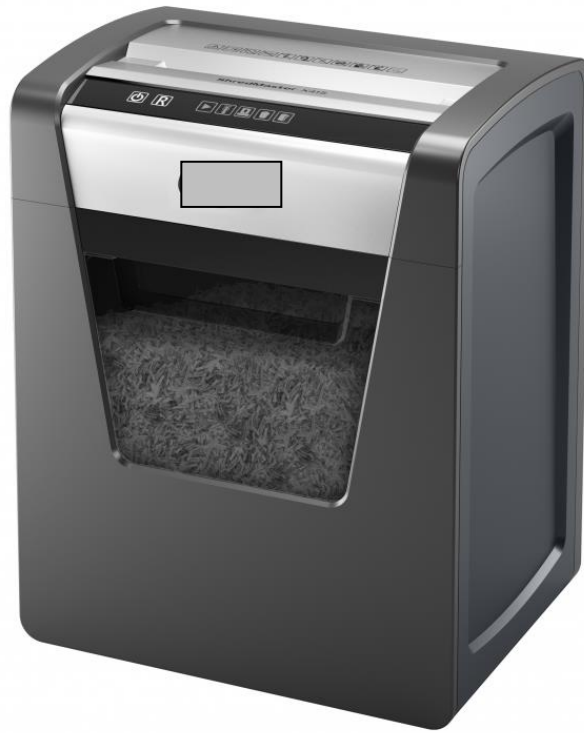
Item No. 30