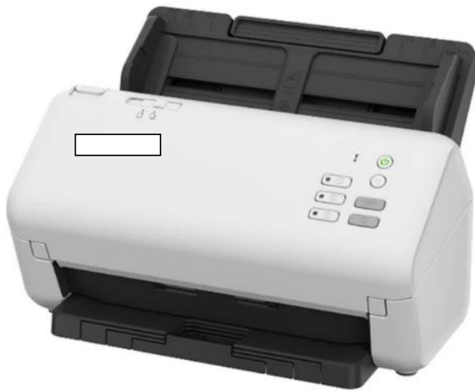
Item No. 28