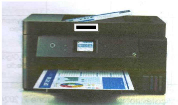
Item No. 6