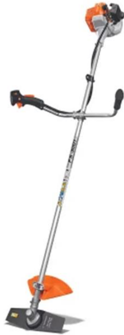
Item No. 8