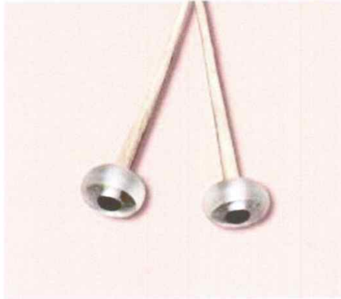
Item No. 6