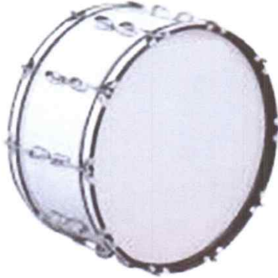
Item No. 4