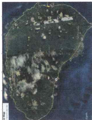
MAP OF SIBUYAN