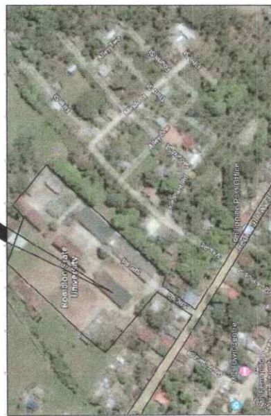
2 LOCATION MAP SCALE 1:100 FT. REHABILITATION OF MULTI-PURPOSE BUILDING 1