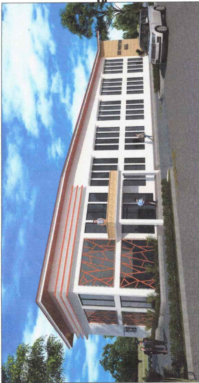
1 PERSPECTIVE SCALE 1:100 FT. REHABILITATION OF MULTI-PURPOSE BUILDING 1