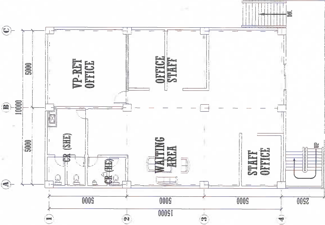
2 SECOND FLOOR PLAN A-2 A-2 SCALE 1:100